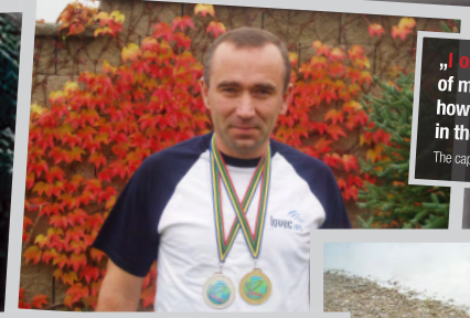
"I only catch with your wobblers, which I absolutely trust. Plenty of major league competitors bought Lovec-Rapy lures after seeing how successful I was with them. Lovec-Rapy lures helped me even in the worst conditions and when all other lures failed." The captain of the golden Czech national spinning team in 2008.