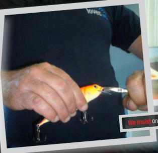
We insist on hand painting which makes every lure unique.