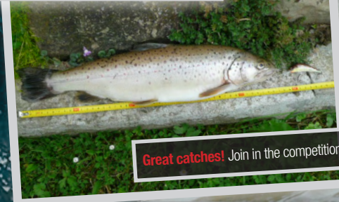
Great catches! Join in the competition on the web page www.lovec-rapy.com