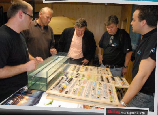
Meeting with anglers is vital.