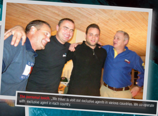
The personal touch. "We travel to visit our exclusive agents in various countries. We co-operate with exclusive agent in each country."